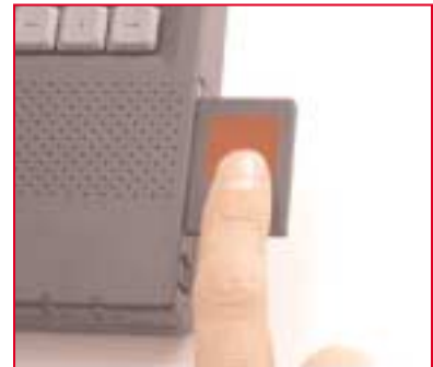
3. Place finger on reader