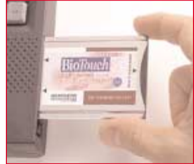
1. Insert BioTouch PC Card Reader