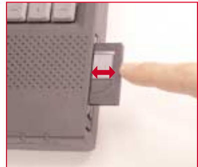
2. Pop out fingerprint reader